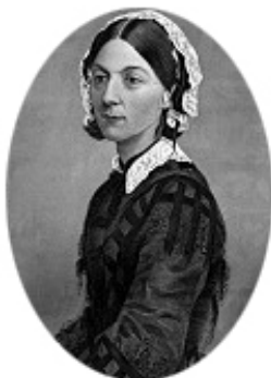
FLORENCE NIGHTINGALE English Nurse May 12, 1820 – August 13, 1910

Named for the city of her birth, Florence Nightingale and 38 other nurses brought care and comfort to the British wounded during the Crimean war from 1854-1856. Now considered the founder of modern nursing, she averaged only four hours of sleep each night. The image of Florence as "The Lady with The Lamp" is based on her late nights on the front: