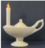
Medium Battery Candle